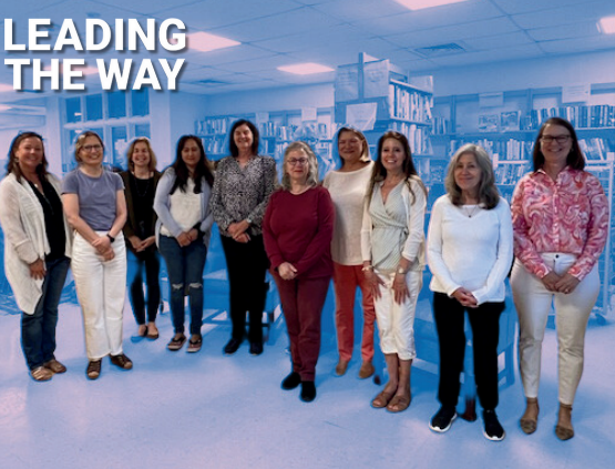
LEADING THE WAY

Literacy Volunteers Valley Shore, a longtime community partner of Middlesex United Way, is dedicated to bridging the language gap for more than 250 adults in the shoreline community, including many recent immigrants from nearly three dozen different countries.